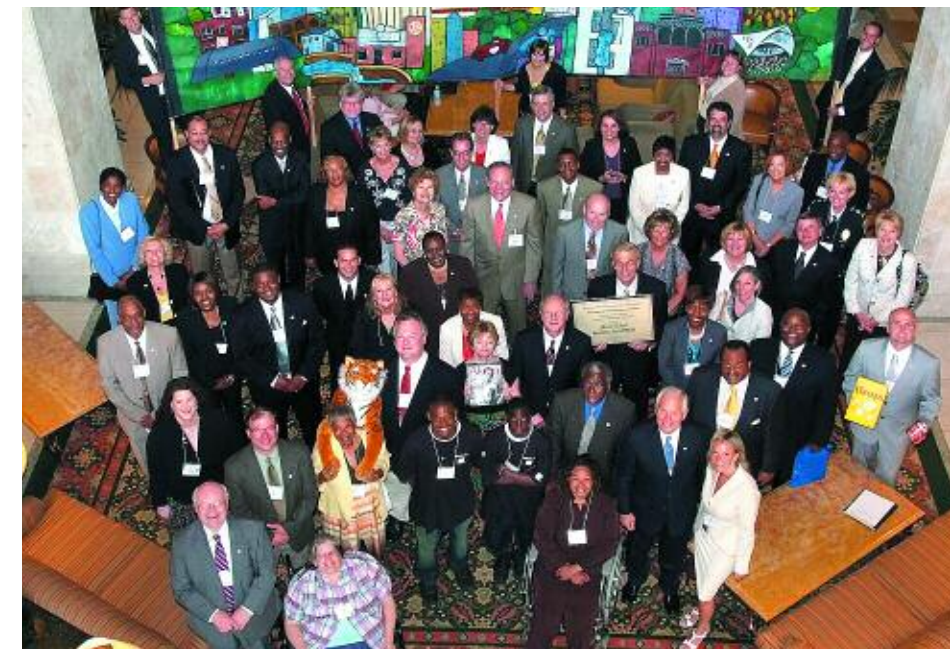
Members of the Akron delegation that accompanied Mayor Plusquellic to the annual competition smile for the camera.

According to the National Civic League, "the All-American City Awards recognizes communities for collaboration, inclusiveness, and successful innovation. All-American Cities demonstrate community-wide civic accomplishments, cross-sector cooperation, grassroots participation and creative approaches to issues such as the need for low-income housing, support for at-risk youth, downtown revitalization and healthcare for the uninsured."