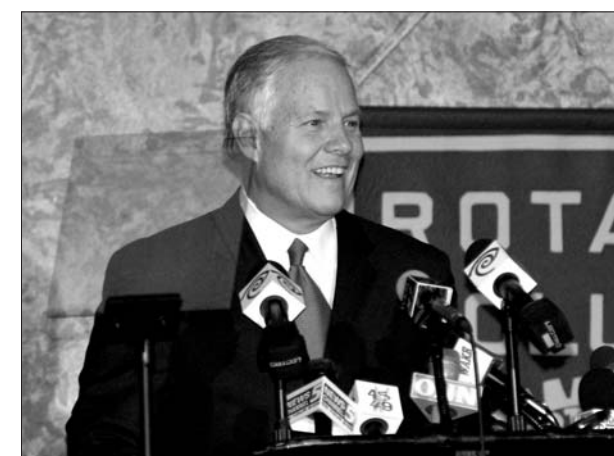
Mayor Plusquellic identified key achievements in 2005 and outlined his goals for the coming year.

will hurt the local communities. In an effort to counteract some of the loss of state and federal funding, Mayor Plusquellic supports the proposed 1/4 cent sales tax increase for Summit County that would benefit law enforcement and economic development.